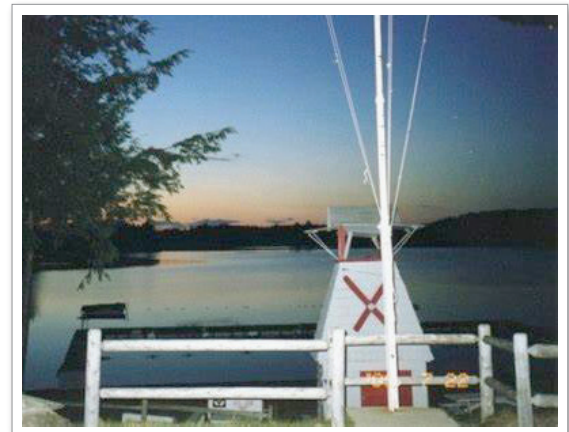
BELOW: Camp Quinapoxet Waterfront