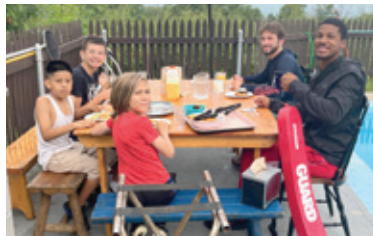
Breakfast by the pool

veteran staff members return as PCs who acted as leaders and role-models to their peers on camp. Finally, we welcomed 11 new PCs, representing Turkey, Germany, and the United Kingdom whose cultural diversity elevated our program and opened our cultural perspectives.