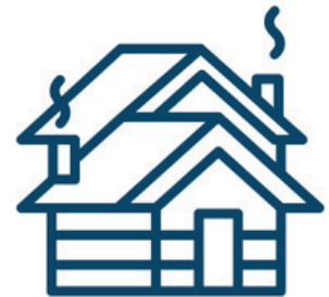
Margaret Gurney Fund: Housing

Help us shape the FUTURE OF PROMISE – make your gift today and secure the next century for Brantwood Camp.