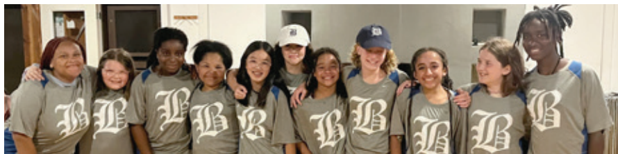
Girls B Jersey winners