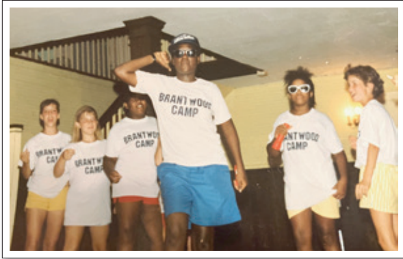
ABOVE: Campers performing at skit night at Holiday House

as she was about to ring rising bells, the COD (Counselor of the Day) discovered a note from a neighbor taped to the bell with a request: