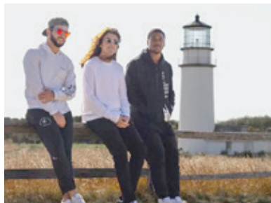
Nantucket Auction Winners