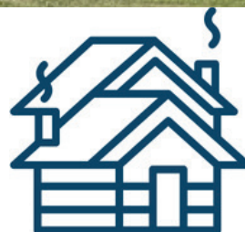
Margaret Gurney Fund: Housing